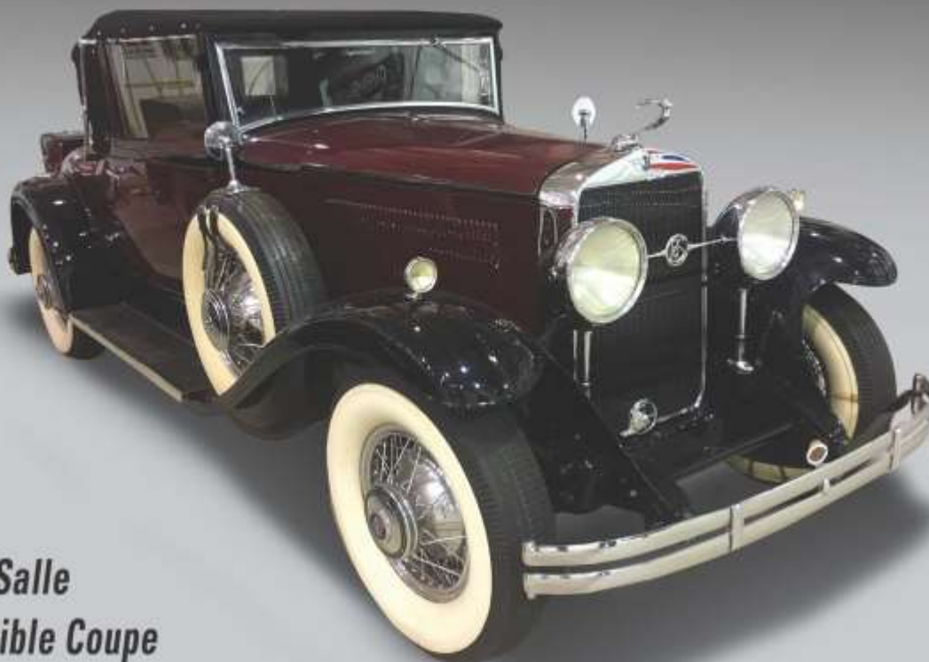
1930 LaSalle Convertible Coupe